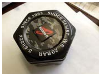
Individual watch packing box made using recycled resources