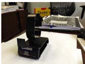
Watch display stand made using recycled resources

These activities have been recognized by the Morris County Municipal Utilities Authority (MCMUA), which promotes environmental protection by presenting awards to companies for their green endeavors.