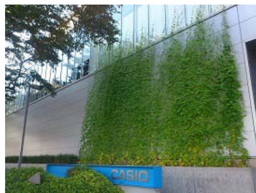
The green wall of vegetation covers the surface with bitter melon and morning glory.

The initiatives of the Hachioji R&D Center make a significant contribution to reducing CO 2 and energy conservation. They also play a further role in environmental education via descriptions given during facility tours for elementary and junior high school students from the local area and beyond and others who visit the Hachioji R&D Center.