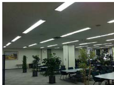
LED lighting in the Hamura R&D Center lobby