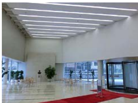
LED lighting in the lobby of the Hatsudai headquarters

Through the active adoption of LED technology within the Casio Group, energy consumption for lighting has been greatly reduced. As of March 2016, about 4,200 LED fixtures have been installed, saving about 87 tons of CO 2 emissions per year compared to conventional fluorescent lamps.