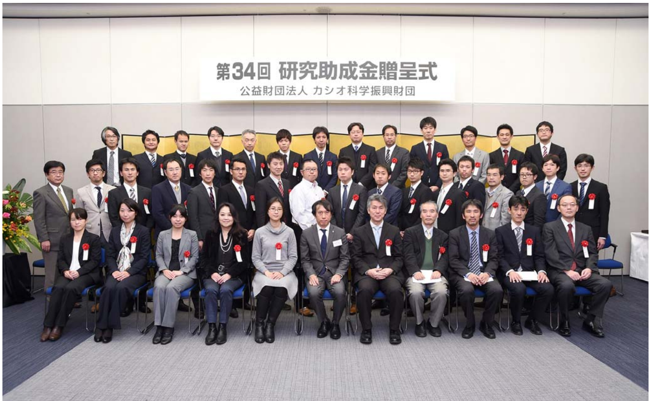
The 34th grant presentation ceremony (fiscal 2017)