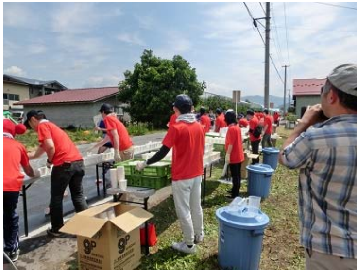
Casio employees volunteering at a water station

In order to forge even deeper relationships of cooperation and trust with local residents, the company will continue to actively promote this kind of community contribution activity.