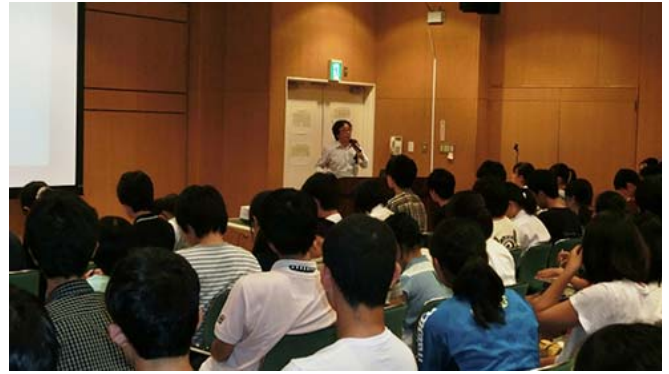
Developer tells the story of the creation of G-SHOCK

*For more information on Casio school visits, see “ Class on Life ” in the Feature Story section of the 2013 report.