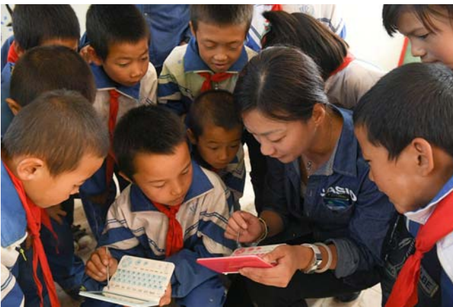
Trying out an electronic dictionary

Casio (China) intends to continue supporting the growth and education of children through programs like My Dream Backpack, while demonstrating the corporate creed of “Creativity and Contribution.”