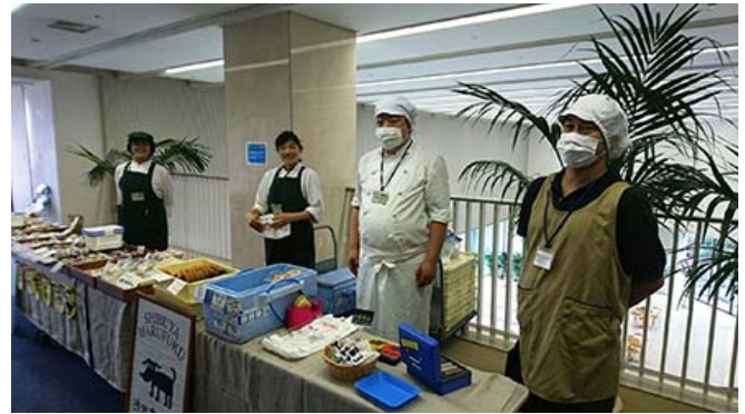
Bake sale table