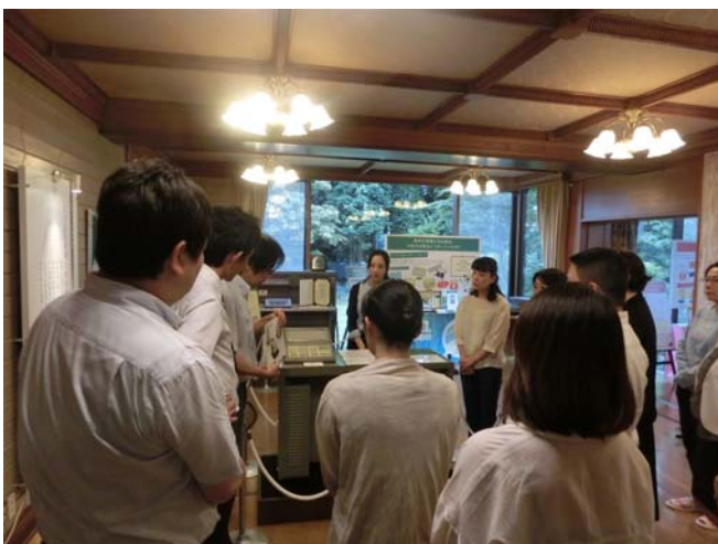
Observing a demonstration of the 14-A in operation at the Toshio Kashio Memorial Museum of Invention

Casio will continue accepting schoolteachers for training in the private sector in the future, in order to contribute to the education of the children who will be the torchbearers of the future.