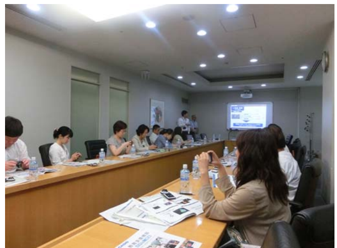
Trying high-speed shooting with Casio digital cameras