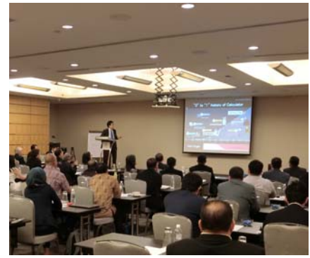
GAKUHAN conference with invited participants from the education ministries of various countries and key persons from education circles

GAKUHAN activities have so far been conducted through cooperation with the education ministries and teachers in each country concerned. However, Casio is now planning also to promote initiatives in collaboration with university research institutions and NPOs.