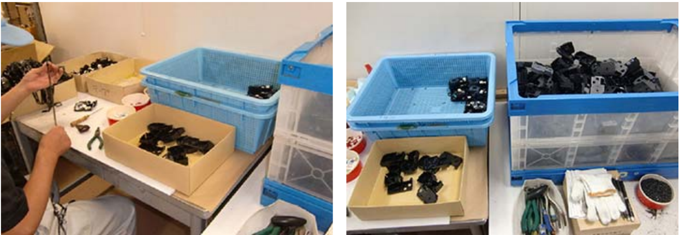
Disassembly and separation of tape cartridges and ink ribbon cassettes

Aiming to be a company that is good for people and environmentally friendly, Casio Business Service Co., Ltd., has contracted disassembly and separation work of Casio products to a welfare workspace operated by a social welfare corporation as part of its recycling initiatives in product disposal since 2000. Recently, the workspace has been disassembling and separating mainly used tape cartridges and ink ribbon cassettes collected at Casio Eco Stations. At the welfare workspace, which enrolls persons with disabilities, most of the work is light work such as making bags and presentation boxes and folding leaflets. Work such as disassembly and separation increases their concentration and ability to keep going on a task, which also gives the workers a high sense of fulfillment on the job. This initiative is considered to support the independence of workers through social education and the acquisition of morals and rules. As part of its CSR initiatives, Casio Business Service will continue contracting out this work to help support the independence of workers.