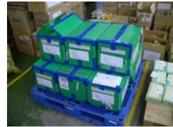
A reusable shipping carton employed for distribution in Asia

Casio has now begun to introduce even larger shipping cartons. The large shipping cartons are mainly used for ocean transport. Packaging damage can be avoided through the use of LCL shipping (freight from different companies in one ocean shipping container), which also eliminates the need to use air transport when the shipping volume is small. Casio has been using these large shipping cartons to ship products since fiscal 2012, and in fiscal 2014 new shipping cartons with even greater strength were added to the lineup of shipping supplies.