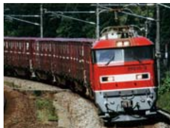
Promoting a modal shift to rail transport