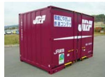
Environmentally friendly rail containers

CO 2 emissions for logistics (Environmental Data)