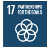
Environmental goals under the SDGs