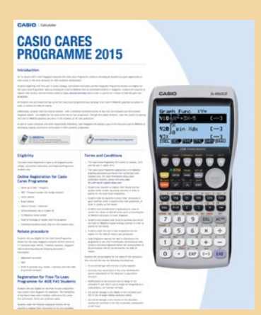
Visit our website to learn more about the Casio Cares program and Casio's contribution to education.

The other initiative is the Buy-Back Programme. Students who purchase the Casio FX-9860Glls graphing calculator can receive SGD$60.00 cash back when they return their calculator to Casio Singapore upon graduation.